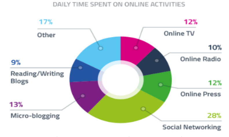
Figure 3: Daily time spent on online activities by Ugur, 2014. (Ugur, 2014)

Moreover, according to the research works conducted in order to determine how people spent their time being online out of 54% of people who spent their time online 28% of them spent their time on social platforms: such as Facebook, Instagram and etc 17. The chart below exhibits the time spent online: