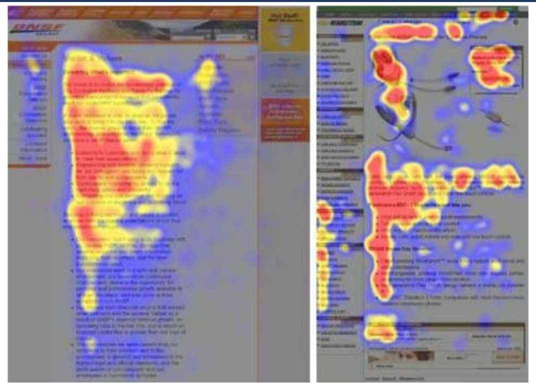
Figure 1: "Design for scanning, not reading" by Simpson, 2015. (https://econsultancy.com/why-visitors-only-read-20-of-your-web-page/)

INTERNATIONAL SCIENTIFIC JOURNAL VOLUME 3 ISSUE 1 JANUARY 2024 UIF-2022: 8.2 | ISSN: 2181-3337 | SCIENTISTS.UZ