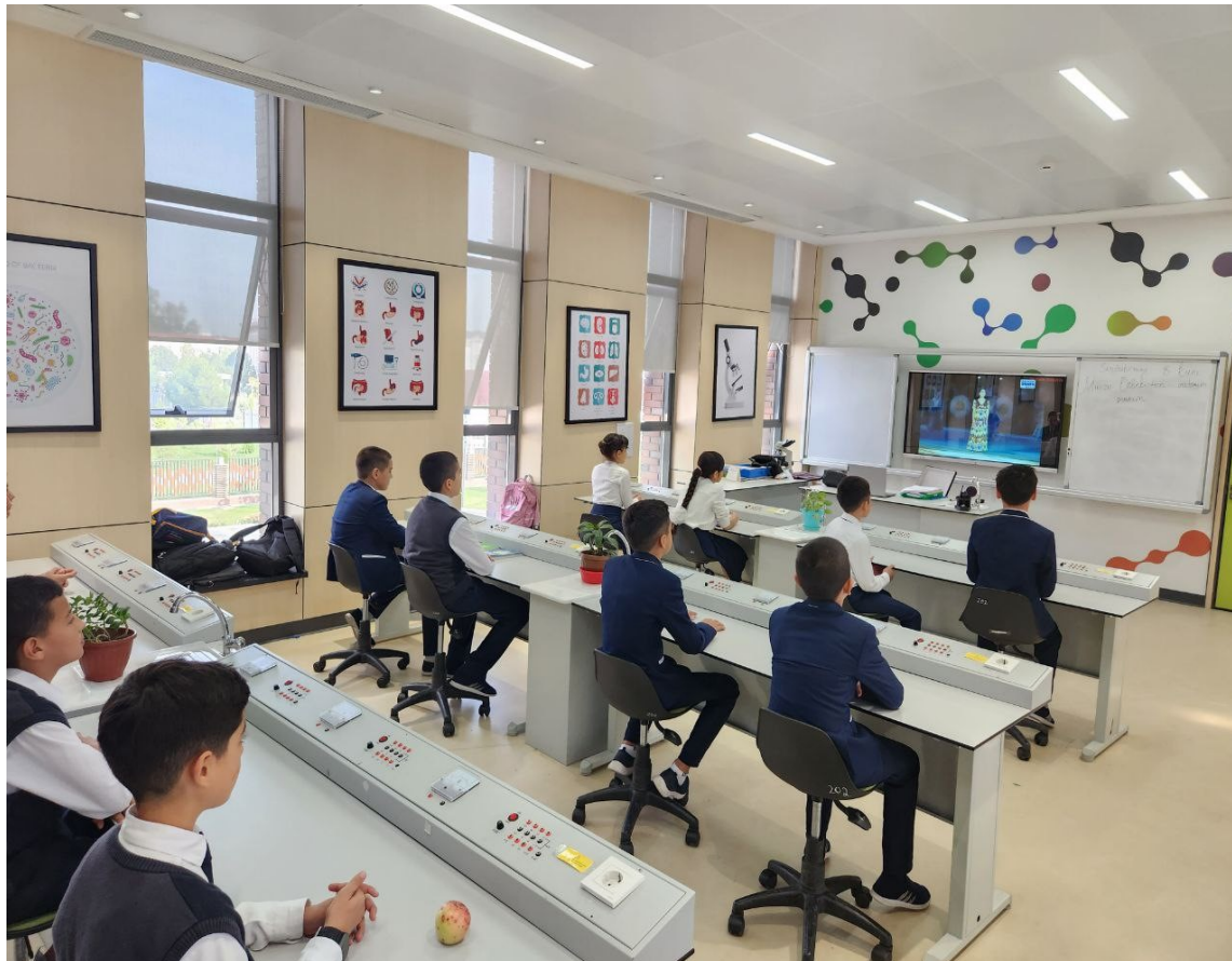
Figure 3. Lesson process in Presidential schools.

Applicants from abroad (who are not students of Presidential schools) can take any type of exam, depending on their knowledge and desire, regardless of the grade they study in.