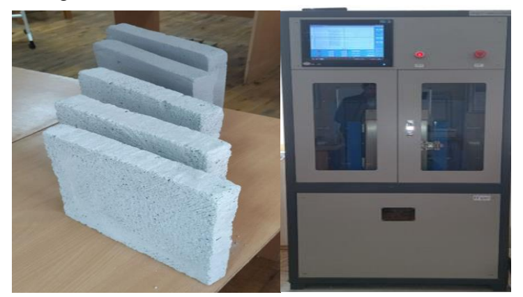
3-picture. Samples of 300*300*50 mm for determining thermal-physical parameters of lightweight concrete.

In laboratory conditions, when obtaining blocks with a porous structure, 10x10x10 sm cubic samples were obtained by mixing cement and filler in different proportions and using gasgenerating additives. According to the results of the research, with the increase in the amount of microsilica in the mixture, the volumetric weight of the samples was observed to decrease. The main properties of lightweight concrete are its strength, grades, ability to transfer heat and cold, classes and deformation properties. The physical and mechanical parameters of the obtained porous block samples are given below.