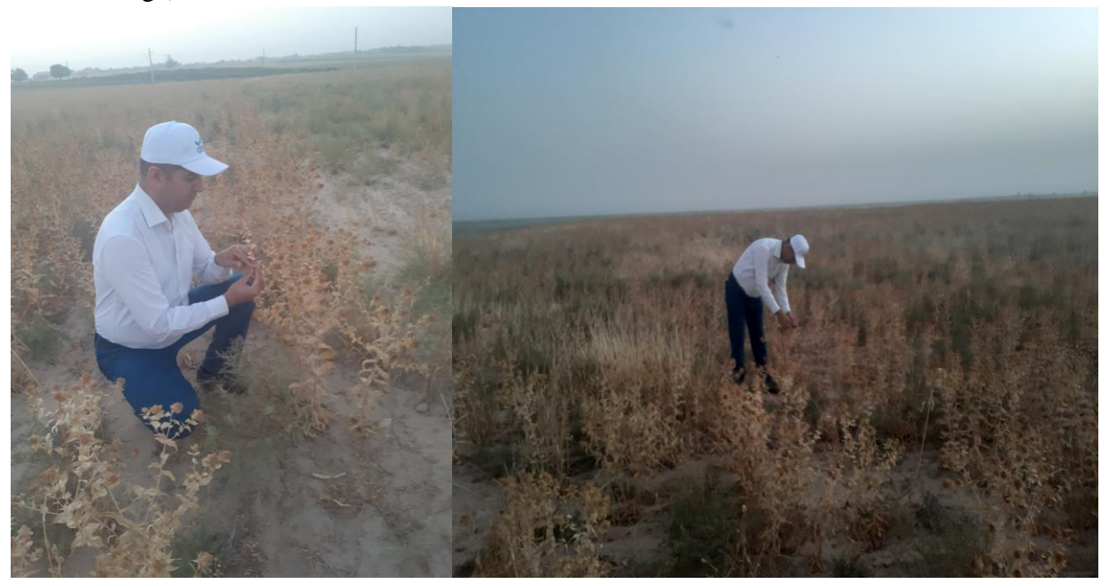
<u>Figures 1-2.</u> The process of determining the biological productivity of sorghum crops in the field of the 5th contour of the Jamshid farm Ch.Ulugov, Ph.D., associated professor, project participant

The project members, in consultation with the head of the farm, plant triticale (120-150 kg/ha) instead of barley on 20 ha in the 1st contour for the harvest of 2023; 10 ha of autumn pea varieties (65-70 kg/ha) per field in the 2nd contour; 5 ha of barley varieties (100-120 kg/ha) in the 3rd contour field, 5 ha of barley varieties (100-120 kg/ha) in the 4th contour field, and 60 ha of early spring wheat (120-150 kg) in the 5th contour field It was proposed to alternate planting varieties of /ga).