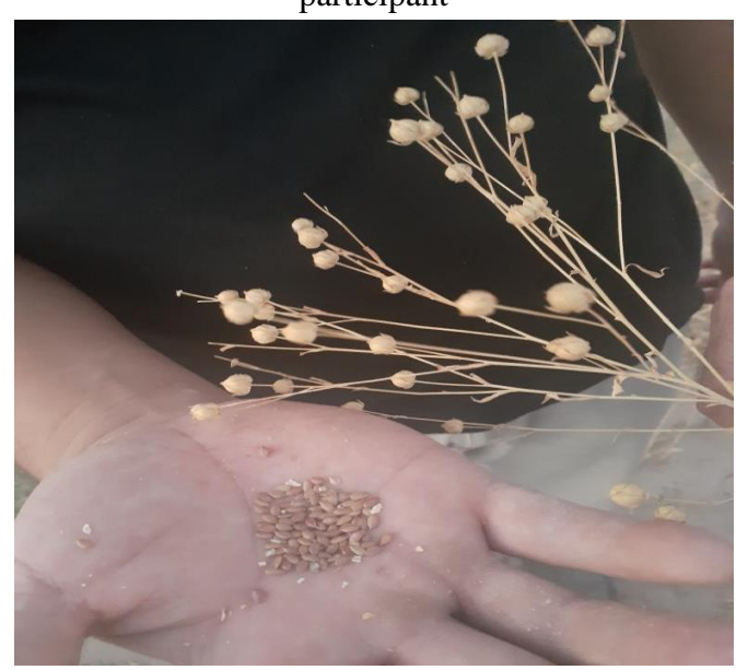
Figure 3. Flax yield determination process in 3 contour of farm

The head of the farm is given constant advice on the correct selection of crop types and varieties, the optimal planting period, the use of standards and methods, and the issues of crop care.