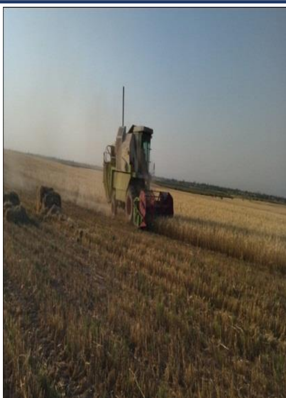
4-5-6 Figures. The process of conducting phenological observations during the phases of the development of the sorghum crop in the field of the Jamshid farm in the 5th contour and the harvesting of the ripe grain crops in the 1st and 2nd contours with the help of combines in "Oltinboev" farm, Sherzod's field

The total cultivated area of "Oltinboev" farm in Qamashi district of Kashkadarya region is 75 ha. The arable land area of the farm is located in 3 contour fields. For the harvest of 2022, 15 ha of barley were planted in the 1st field, 15 ha of flax in the 2nd field, and 4 ha of wheat in the 3rd field. Based on the rotation system, taking into account the soil and climate conditions of the region, autumn peas (65-70 kg/ha) instead of barley (65-70 kg/ha) for the 1st field, triticale varieties instead of flax (120-150 kg/ha) for the 2nd field 15 ha, it was recommended to plant triticale (120-150 kg/ha) instead of wheat crop on 4 ha in the 3rd field.