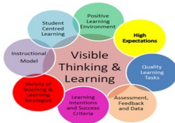
Figure-1. Overall vision of Visible thinking and learning.

High quality learning and teaching is the development of individuals into responsible future leaders equipped with high levels of knowledge, skills and values, incorporating a student-centered learning approach, catering for the learners' personal and cultural well-being to make a positive impact in a globalized world.