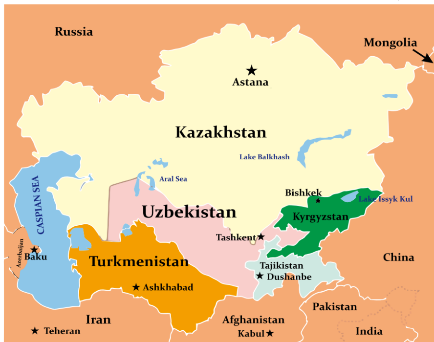
Figure 1. Uzbekistan on the map of Central Asia

(2020 Environmental Performance Reviews Uzbekistan Third review)