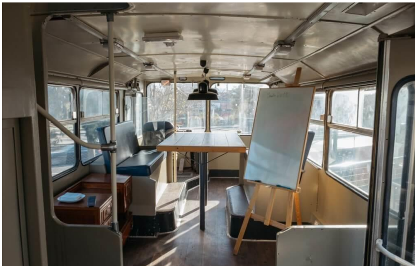
Figure 2. Interior of Village Underground Lisbon coworking center in Lisbon, Portugal.

As an innovation space, Workshop17 is a hub where there's entrepreneurship for positive outcomes in both social and economic change. In a shared workspace, Workshop17 is where start-ups, companies, profit or non profits can work and share the same vision in one dynamic environment.