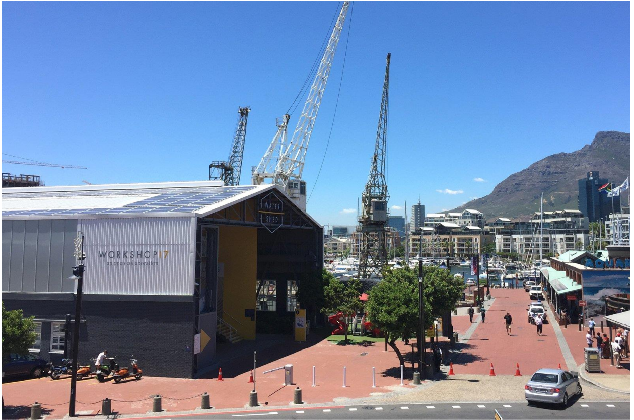
Figure 3. WORKSHOP 17 coworking center in Cape Town, South Africa.

productivity, creativity, and collaboration. Located in seven secure buildings across the cities of Johannesburg and Cape Town, every Workshop17 coworking space is furnished with the creative outputs of local designers and furniture manufacturers and equipped with the latest in advanced technology to ensure optimal productivity is achieved and maintained (Figure 3).