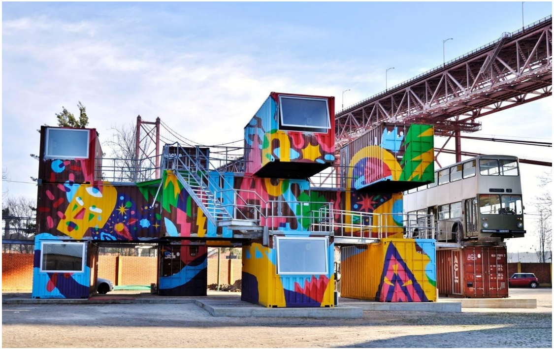
Figure 1. Village Underground Lisbon coworking center in Lisbon, Portugal.

a sound recording studio. It hosts music, theatre, cinema and dance events with a focus on street culture (Figure 1, 2).